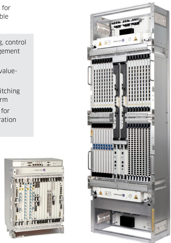
Alcatel-Lucent 1830 PSS converged WDM/OTN platform