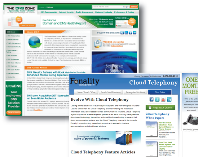
Sample Global Online Community and Channel

More than 3,000 relevant and credible news items and articles are posted daily on TMCnet. We have a first rate team of industry expert bloggers and over 80 editors contributing to our site.