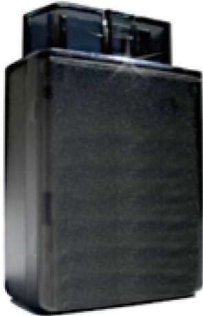
The innovative datalogger (DL) device is a small, self installed wireless communication device for monitoring and logging vehicle and driver performance..

Powerful fleet management is no longer the domain of long haul big rig fleets. Fleets of all sizes and vehicle types have been discovering the powerful effects on fuel spend, efficiency, and safety that technology can bring to any fleet. With Xora InVehicle DL any organization can improve the way they manage their vehicles and drivers. Just plug in the device and go.