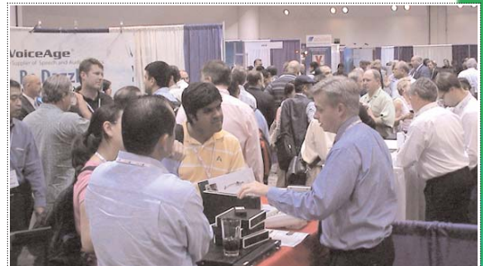
Business being conducted in the exhibit hall of Communications Developer Conference's opening night reception (2006).